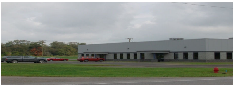
Base Technologies became the first business to occupy the Arcade Business Park