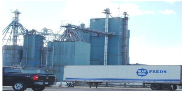
Blue Seal Feeds Completed expansion and packaging project