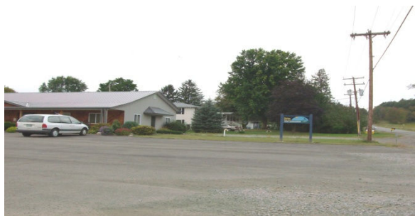
Western NY Crop Management's new home in South Warsaw