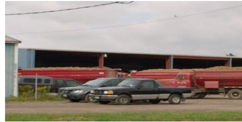
Marquart Harvest Trucks