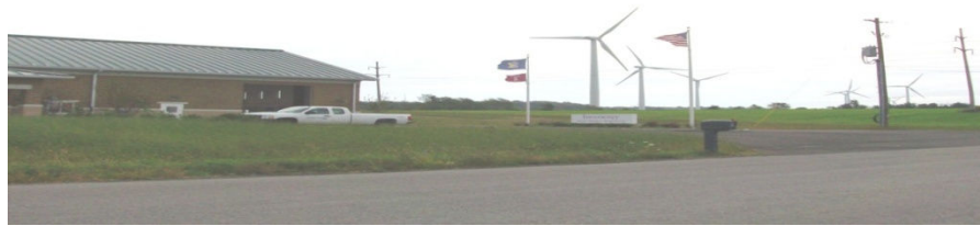
High Sheldon Wind Farms Operation Center on North Sheldon Road