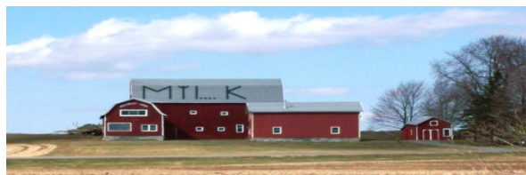
Wyoming County Is the leading Ag County in NY State