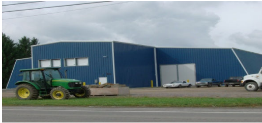
Marquart Bros, LLC New Potato Storage Facility