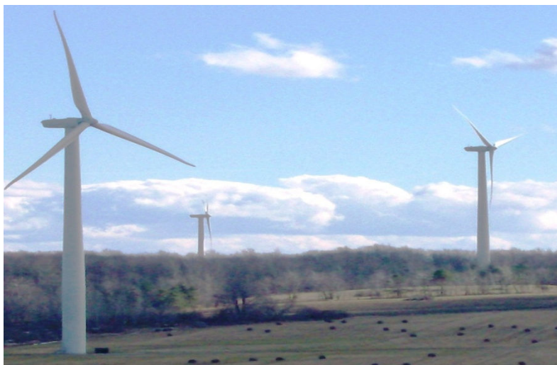
Noble Bliss Wind Park Turbines, some of the 237 wind turbines in Wyoming County