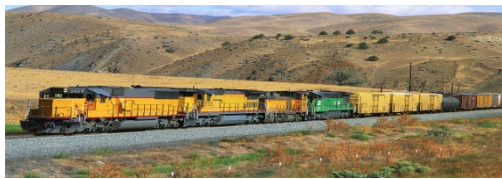
The Rail initiative Grant became a reality