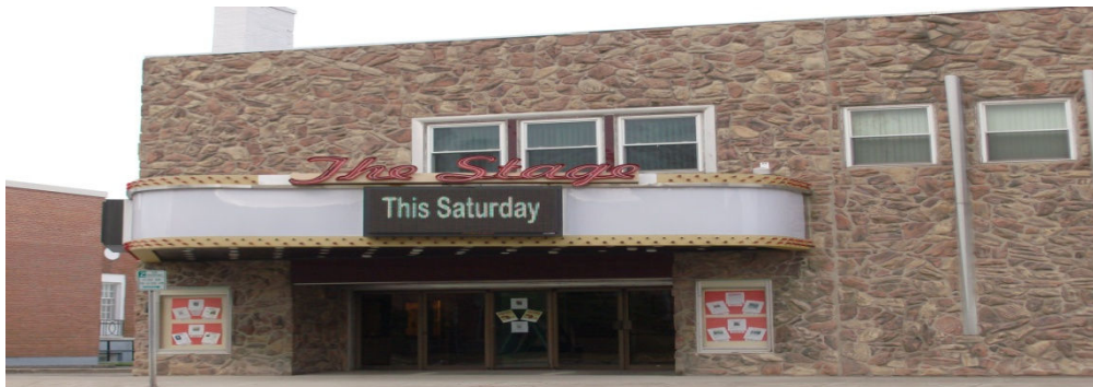
The Stage made improvements to its façade and interior with help from Microloan and IDA funding